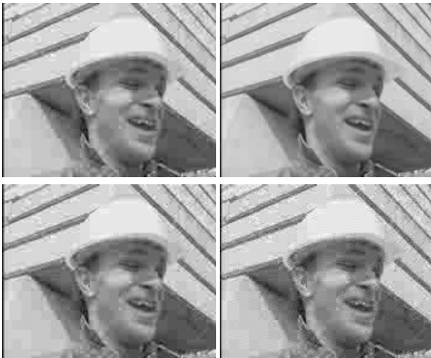
Fig. 3. Encryption results for Foreman FGS video. Top row, left to right: base layer plus 1 and 2 unencrypted FGS bitplanes; Bottom row, left to right: encryption settings (a) and (b).

We use 10 frames from the Foreman to demonstrate the protection of the enhancement layer while preserving the FGS characteristics. The proposed intra bitplane shuffling is applied within each 8x8 block. We also encrypt the sign bit of each coefficient using a stream cipher. Two encryption settings are used: (a) to shuffle the 1st FGS bitplane, and (b) to shuffle the first two bitplanes. To focus on the protection of the enhancement data, the encrypted FGS bitplanes are combined with a cleartext base layer video to show the visual effects of encryption.