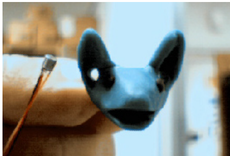
Wideband system (10 kHz to 100 kHz)

ISR researchers are studying how the physical shape of a bat's head, its flight behavior, its choice of sonar pulse and its repetition rate contribute to the incredible sensory performance it achieves. Engineering efforts to replicate some of these tasks do not come anywhere near the performance in weight, speed and power consumption of a common bat.