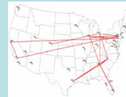
Routes used in this study

This research investigates the influence of several factors that might be expected to influence a flight's estimated time en route (ETE): origin airport, destination airport, month of year, day of week, hour of day, aircraft type, and carrier. The main interest is to see whether the ETEs in